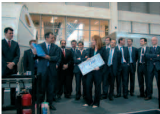
The European astronauts making a donation to the ISS Education Fund