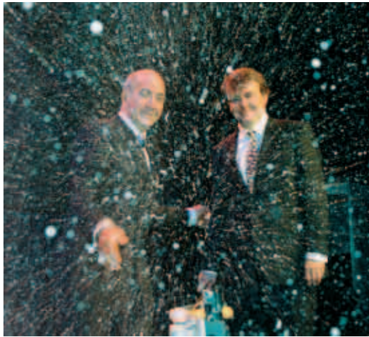
Liftoff for the third edition of the Physics on Stage science teaching festival! His Royal Highness Prince Johan Friso of the Netherlands (right) launches a water-powered rocket as the opening act