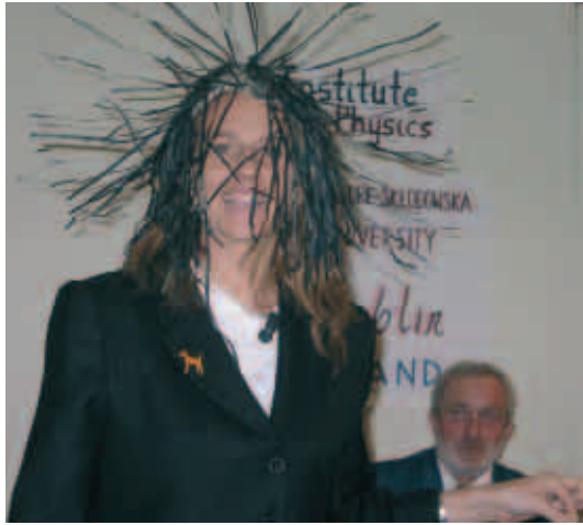
Physics on Stage 3 was an 'electrifying success'