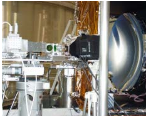
The carbon-fibre-reinforced reflector for ESA's Planck spacecraft under test at the Centre Spatial de Liège (CSL)