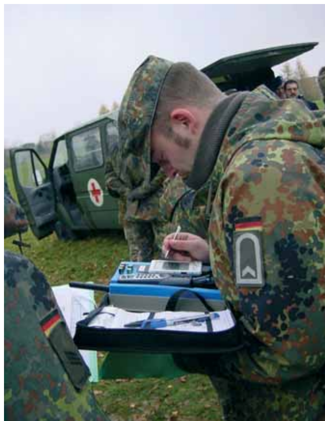
Project DELTASS: the portable terminal used by the Search & Rescue (SAR) teams to fill in the electronic patient record card. The link with the coordination centre is via the Globalstar satellite system