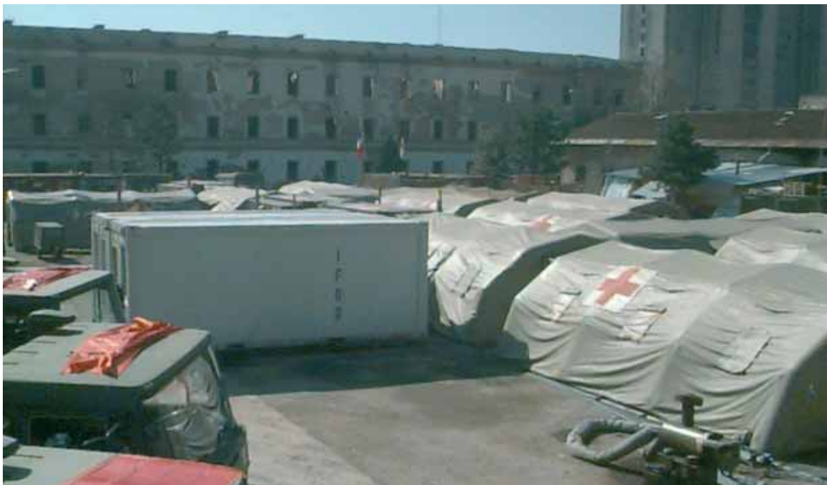
The field hospital in Sarajevo which hosted the ESA Telemedicine Facility from 1996 to 1999

With the launch of the Multimedia Element of ESA's ARTES programme – Advanced Research in Telecommunications Systems, dedicated to promoting and enhancing the competitive position of European and Canadian industry and operators in the field of satellite-based multimedia – Telemedicine quickly became a hot topic for that part of the programme dedicated to the development and