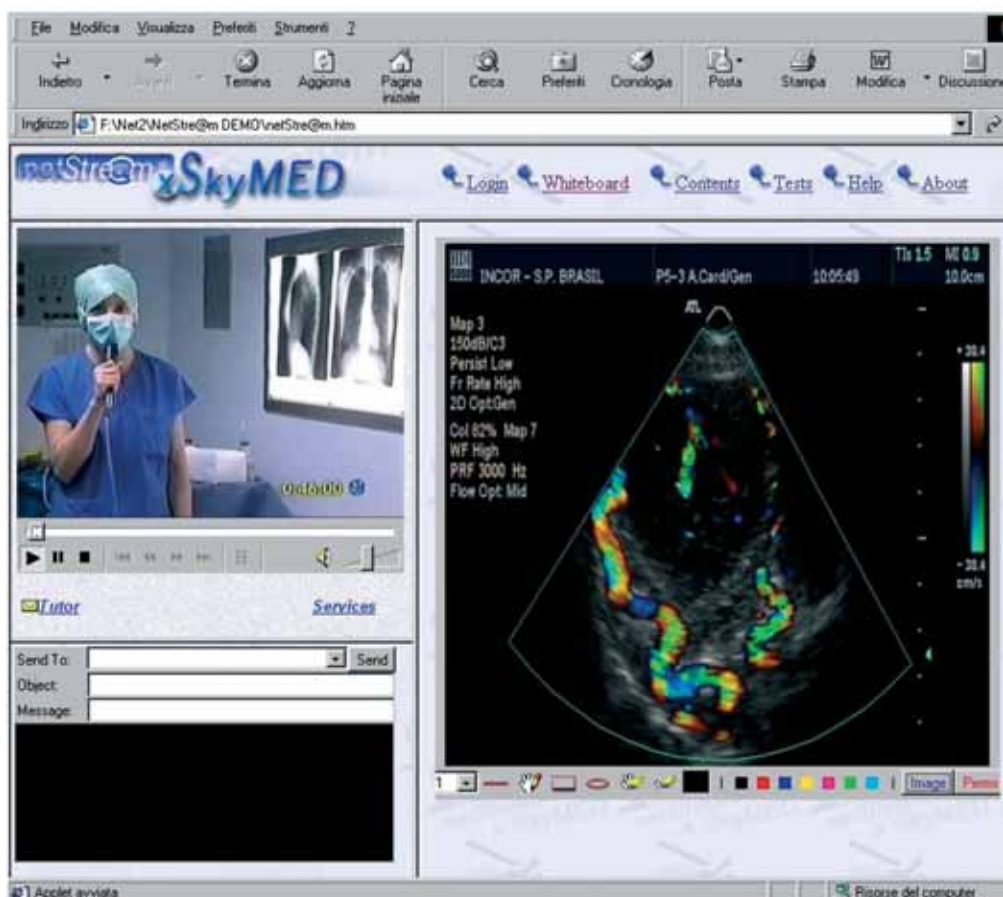
Project SKYMED: the multimedia interface used for the on-line distribution of a course on ambulatory surgery. The signal is transmitted via satellite using the Internet Protocol and DVB-S (Digital Video Broadcasting – Satellite) technology