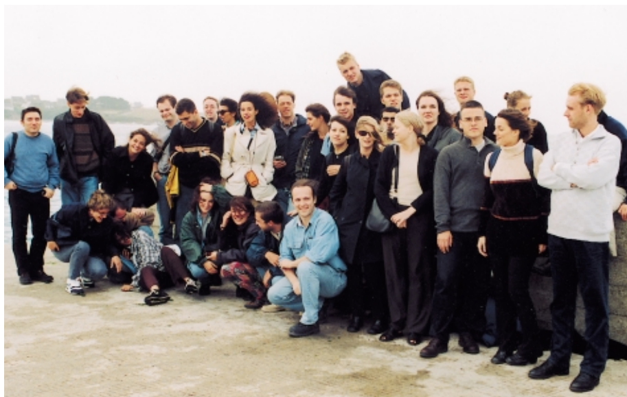
Participants at the 7th ECSL Summer Course.

The students of the Summer Course had to prepare a case for an international conference. The issue dealt with was of actual interest: "How can a satellite constellation, placed on a