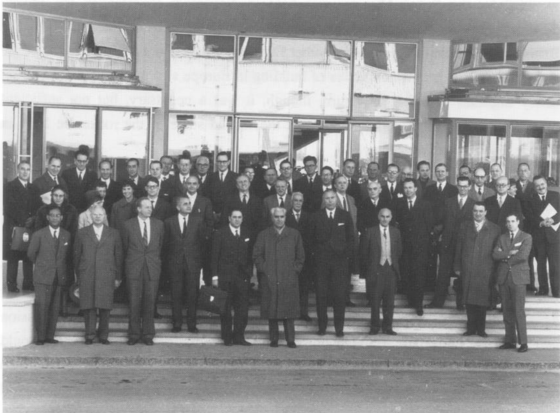
Figure 2. The delegates to the Meyrin conference held from 28 November to 1 December 1960 standing in front of CERN's Main Building (folder Origines de la COPERS IV , Mussard files (cf note 1)).